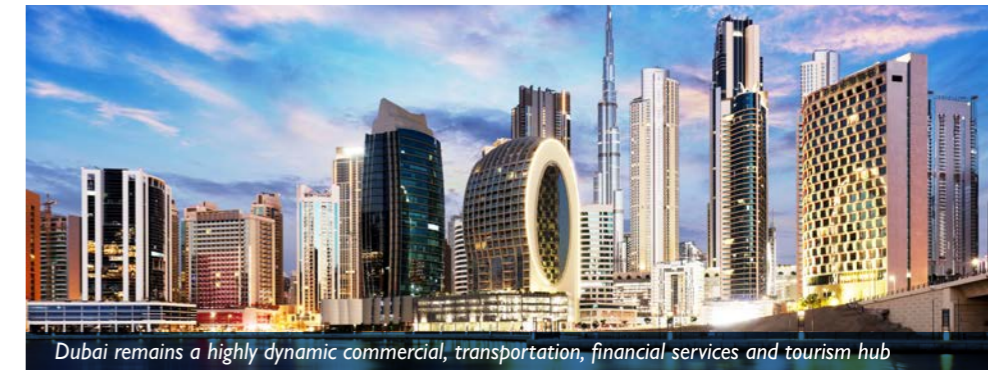
Dubai remains a highly dynamic commercial, transportation, financial services and tourism hub

Global trade tensions have tended to bolster the UAE's position as an essential international business hub. While US tariffs are applicable (in common with other nations), the UAE has turned the challenges into opportunities. For example, tariff differentials between Chinese goods and UAE-origin products makes the UAE an increasingly attractive destination for companies reconfiguring supply chains. The UAE's world-class logistics infrastructure and strategic geographic position provides practical solutions for businesses navigating the complexities of the current global trade environment. There is unprecedented wealth migration to the UAE, as major corporations and high-net-worth investors expand their connectivity to the UAE based on a range of considerations, including stability and security, favourable business climate, and robust investment and business partnership opportunities.