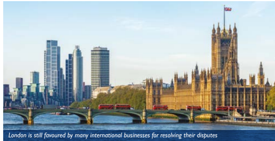
London is still favoured by many international businesses for resolving their disputes

It's very positive. It draws a lot from some of the measures that you have if you're pursuing civil litigation in the UK, which is often very attractive for parties looking to resolve their disputes. For example, it bolsters the orders of emergency arbitrators allowing them to respond swiftly to urgent matters. The interim relief that is available in England is very attractive for many parties, and so ensuring the enforceability of interim orders made by emergency arbitrators makes it very appealing to have a London seated arbitration. There is also a new power enabling summary dismissal of claims and defences with no real prospect of success, so that will also promote the quicker resolution of meritless claims and meritless defences, which is all aimed at streamlining the arbitration process. Arbitration was originally viewed as a faster, more cost-effective alternative to litigation, but that hasn't always been the reality – particularly in complex, high-value disputes. The Arbitration Act is trying to bring some of that efficiency back and streamline the process and prevent it from becoming overly drawn out and costly.