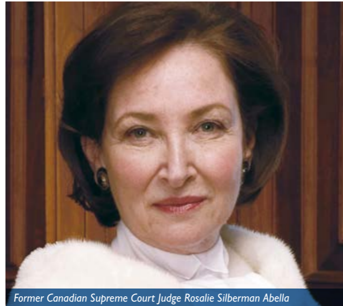
Former Canadian Supreme Court Judge Rosalie Silberman Abella

Abella was called to the Ontario Bar in 1972 and practised civil and criminal litigation until 1976 when she was appointed to the Ontario Family Court at the age of 29. She was appointed to the Ontario Court