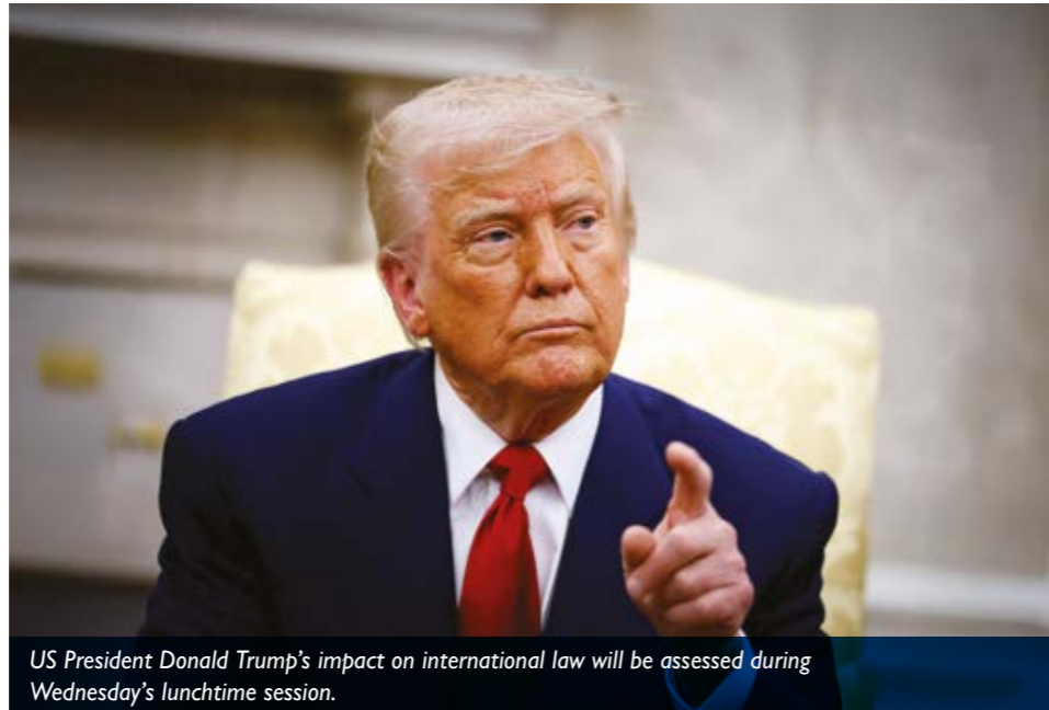
US President Donald Trump's impact on international law will be assessed during Wednesday's lunchtime session.