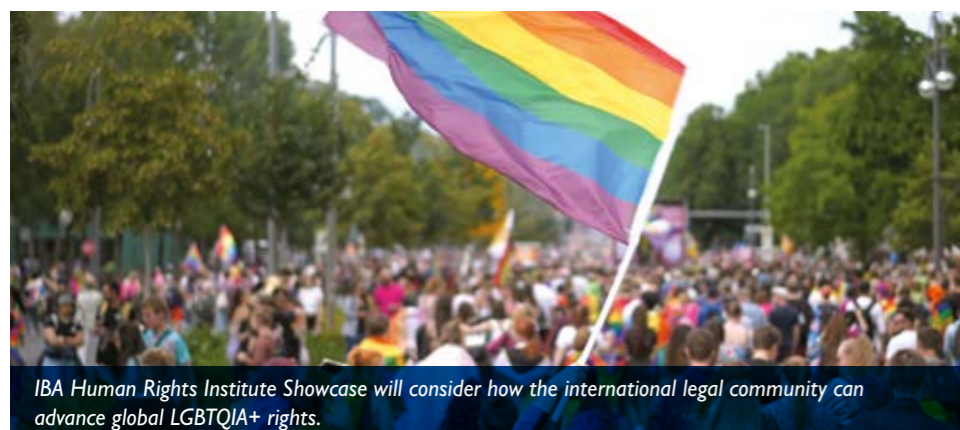
IBA Human Rights Institute Showcase will consider how the international legal community can advance global LGBTQIA+ rights.